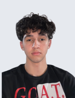
Joaquin Alomia Grant High School